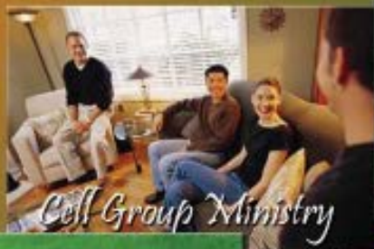
Cell Group Ministry

Training laity for effective ministry in . . .